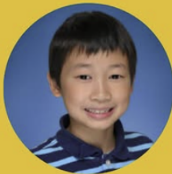
Phinehas as Chip